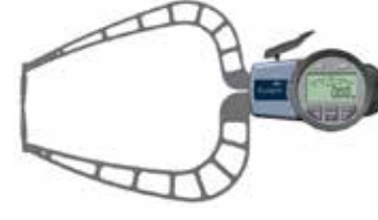
CMT 167 D