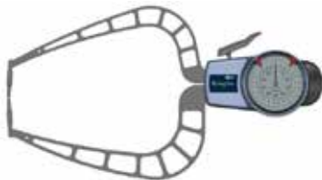
CMT 167 A

Three analogue and digital gauges are available. Special versions e.g. with longer jaws can be supplied.