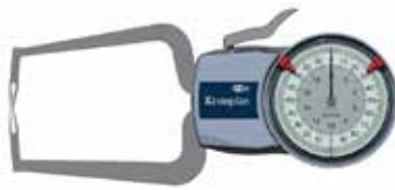
CMT 085 A