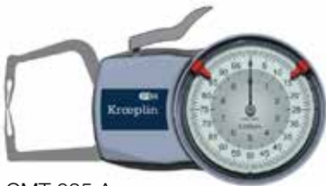
CMT 035 A