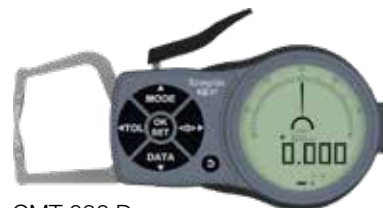
CMT 036 D